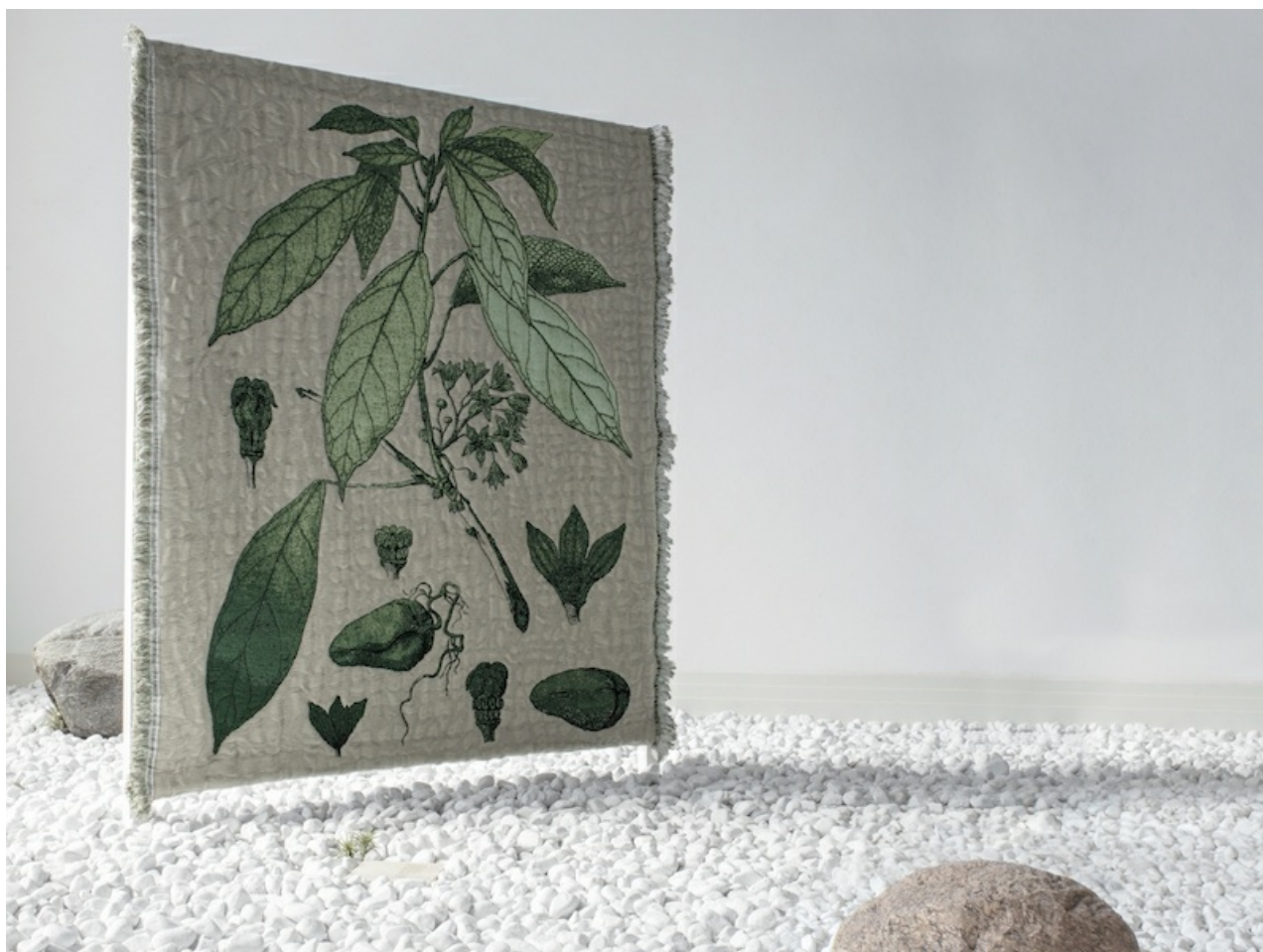
Otobong Nkanga: 'Taste of a Stone', 2020

Also, even if you do not understand the different kinds of English, because there are all kinds incorporated in this work, it doesn't leave you indifferent. The language and tonation have been played with. You can really work with language to play with places of confidence, of brokenness, of numbness, of sadness. And by breaking a word, you can accentuate that.