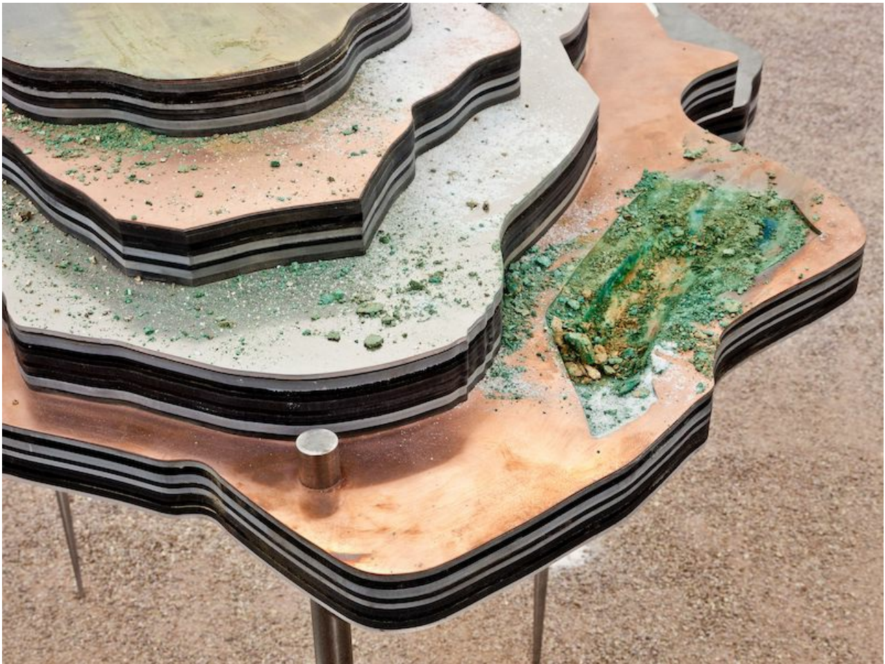
Otobong Nkanga: 'Solid Maneuvres', 2015, Crumbling Through Powdery Air, Portikus

ES: You have mentioned that you are very interested not only in the ways of extraction but also in the ways that things come together, in fusions of elements or energies. Could you elaborate on that?