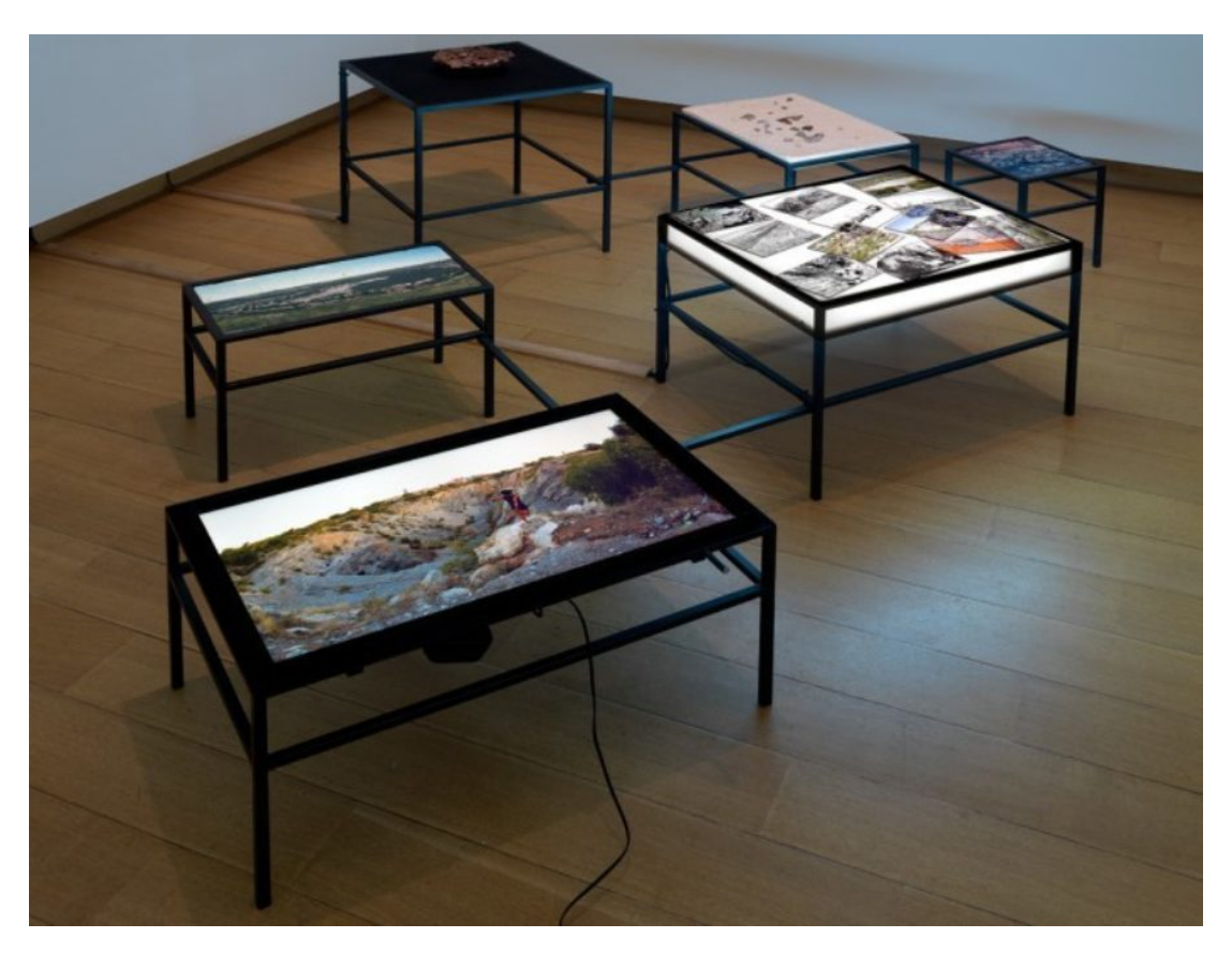
Tsumeb Fragments, 2015

Her installation Tsumeb Fragments merges historic imagery from the Green Hill Mine with the artist's own recordings of the current site. She offers pictures of the rocks and debris, a series of drawings and archival imagery from the local museum.