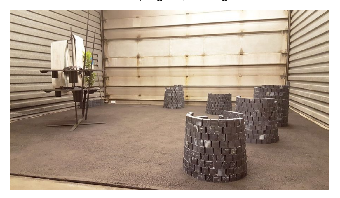
Carved to Flow, Documenta 14, Neue Galerie, Kassel, 2017

something as simple as soap. After that, fifteen thousand pieces of soap were sold during performances in Kassel. Its proceeds allowed Nkanga to launch the third phase of the project: to replant the soap materials in Africa. Since then, she has launched a foundation concerned with circular economics in Akwa Ibom, Nigeria, bearing the same title.