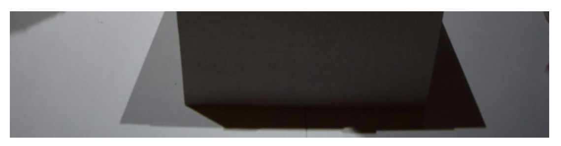
Veins Aligned, 2018 © Ben Davis

The refinement Nkanga bring to each work is remarkable: her respect for recycled materials and her attention to detail. At the 2019 Venice Biennale her work received an honourable mention from the jury. For the Arsenale she created Veins Aligned : a 26-meter-long gleaming sculpture that resembled a human vein spilling over the floor like a river. Manufactured from local materials – Bolzano marble and Murano glass – and crafted in collaboration with local workers, it was another typical example of Nkanga's practice.