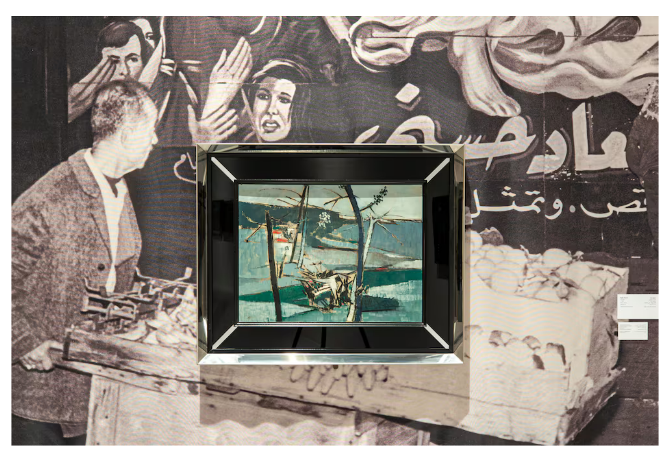
One part of the exhibition focuses on the growth of Beirut's economy, its exchanges with the world and the divides that grew beneath.

Alongside masterful scenography and navigational ease, a sense of wistfulness is palpable across five thematic galleries whose paintings and sculptures sit against blown-up, old, grainy images of Beirut. A healthy dose of archival material is scattered in birch-coloured cases and structures. One would be forgiven for assuming that the predominance of unfinished wood evokes a sense of incompleteness. Perhaps like the material, this is a fragmentary story after all.