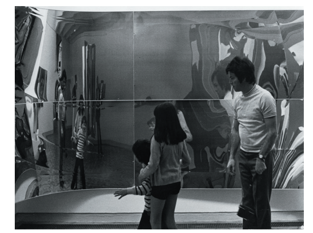
View of the exhibition « Espaces virtuels », Lars Fredrikson, Fondation Maeght, Saint-Paul-de-Vence, 1972