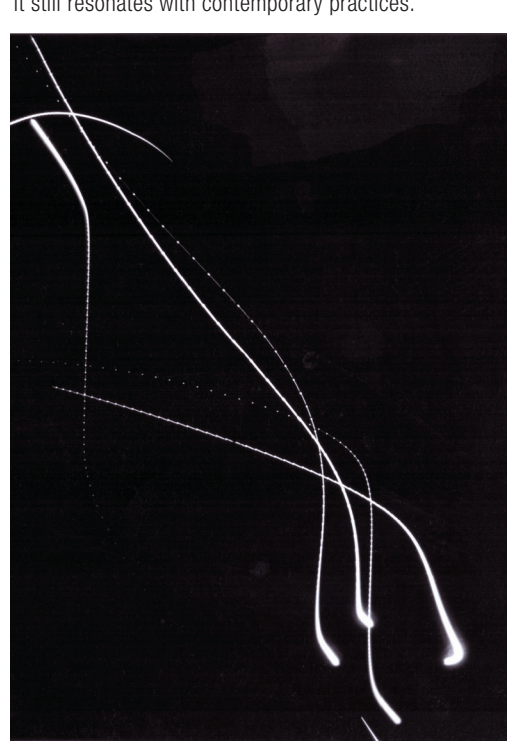
Télévision (détail), 1969 Silver gelatin print 20,2 x 25,5 cm

The exhibition opens with the cosmic dimension of "kinetic" works and steel 3D sculptures before segueing into collages and drawings by fax through to sound installations, of which Fredrikson was one of the pioneers. The show shines a light on his affinities with the Maeght Foundation, his multiple collaborations with poets and, not least, his involvement with the Villa Arson where he set up the very first sound studio at an art school in France, thereby influencing several generations of sound artists right up until today. In this way, the exhibition unveils the current value of the artist's research and how it still resonates with contemporary practices.