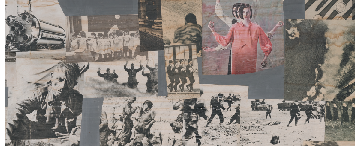
spectator, at the centre of the installation, is subsumed

At the juncture of painting, sculpture and installation, these works form a universe in constant evolution. They interact with the surrounding environment (reflection, air, light, movement of the spectator, sound) to create a space between the real and virtual worlds in which the